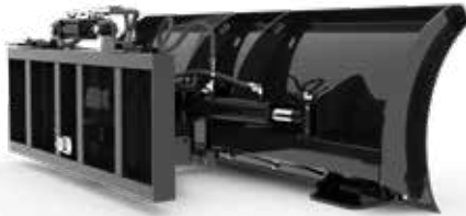
DB84 with standard power tilt